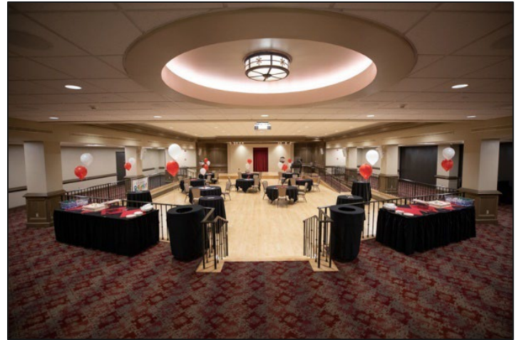
Frangipani room: Central Gathering Space, Meals, Keynote